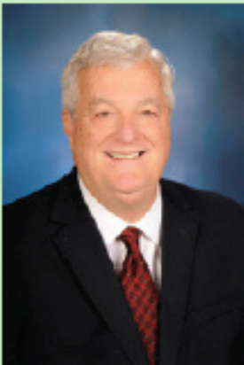
REP. MARK WALKER