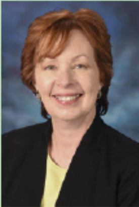
SEN. ANN GILLESPIE